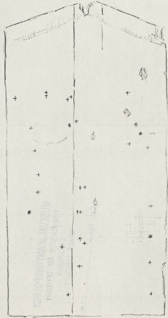
BACK SHOWING LOCATION OF 30 PEGS.