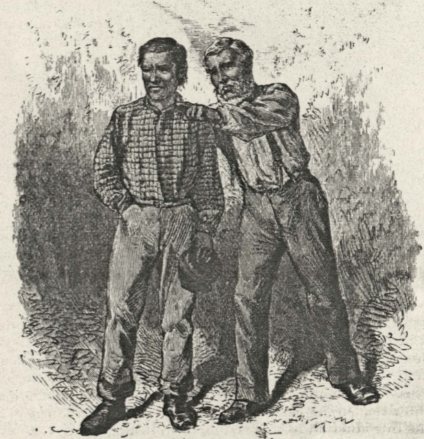
CHIEFS OF THE HAIDA INDIANS.

The halibut is found in great abundance in the vicinity of the islands, and it is more particularly on this fish that the Haidas depend. Their villages are invariably situated along the shore, often on bleak, wave-lashed parts of the coast, but always in proximity to productive halibut banks. Journeys are made in canoe along the coast. The canoes are skillfully hollowed from the great cedar-trees of the region, which, after being worked down to a certain small thickness, are steamed