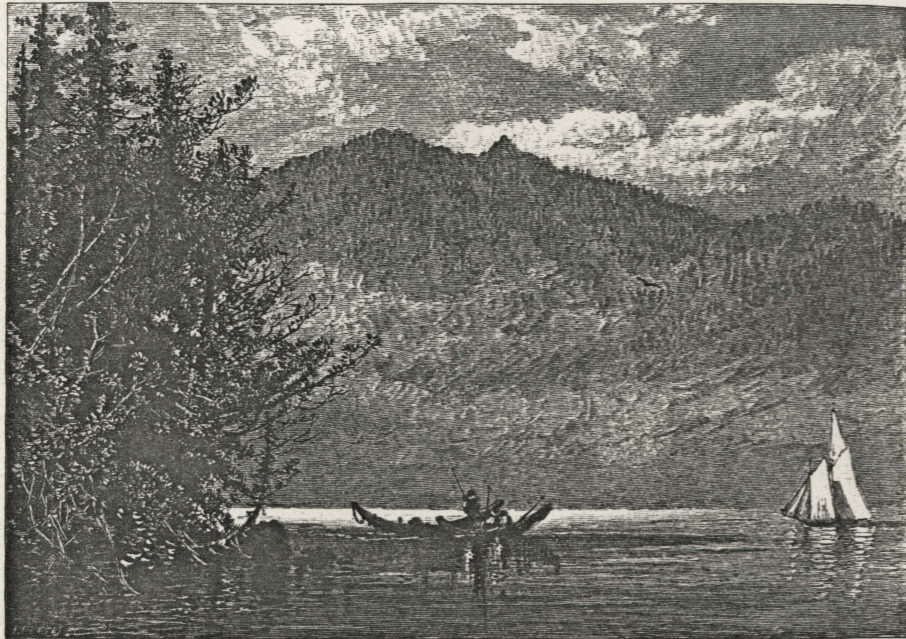
ECHO HARBOR, QUEEN CHARLOTTE ISLANDS.

which they possess, are separated by wide water stretches from the archipelago fringing the coast of the mainland of British Columbia to the north, and from the southern extremity of Alaska to the northwest. They form a compact group,