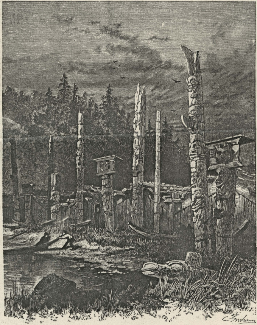
A HAIDA VILLAGE.

ough his Norfolk venerated sters un- upon it. st of the hat elo- a! Hob- It was er who artists. l works St. An- original- Black- Erping- n of the o an as- erings, d under of Eng- ne com- feasted. all that estivals ration, et tones Alboni, at space l listen-